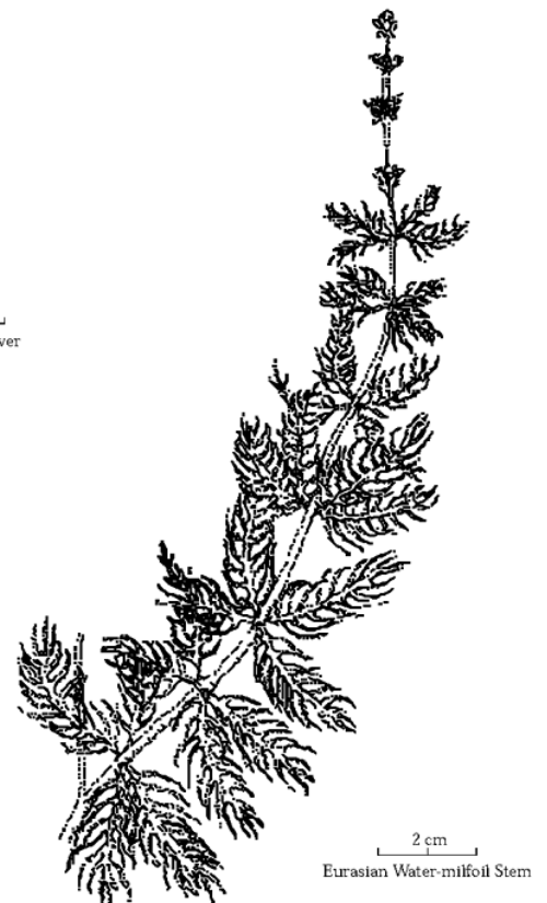
Eurasian Water-milfoil Stem