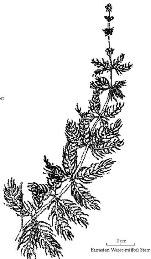
Eurasian Water-milfoil Stem