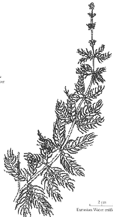
Eurasian Water milfoil Stem